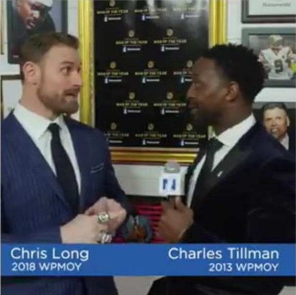
Red Carpet Clip