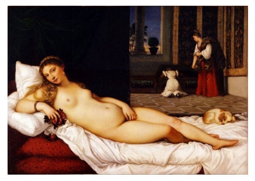
Titian, Venus of Urbino, 1538, oil on canvas

But things were destined not to end there. One of Giorgione's pupils was Titian, and the former student undertook to riff on his master. The resulting Venus of Urbino is a prototypical example of Renaissance imitatio —the creation of an original work from an existing model. See id. , at 8; 1 G. Vasari, Lives of the Artists 31, 444 (G. Bull transl. 1965). You can see the resemblance—but also the difference: