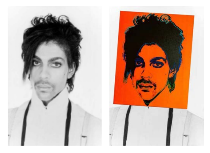
Figure 6. Warhol's orange silkscreen portrait of Prince superimposed on Goldsmith's portrait photograph.

Goldsmith notified AWF of her belief that it had infringed her copyright. AWF then sued Goldsmith and her agency for a declaratory judgment of noninfringement or, in the alternative, fair use. Goldsmith counterclaimed for infringement.