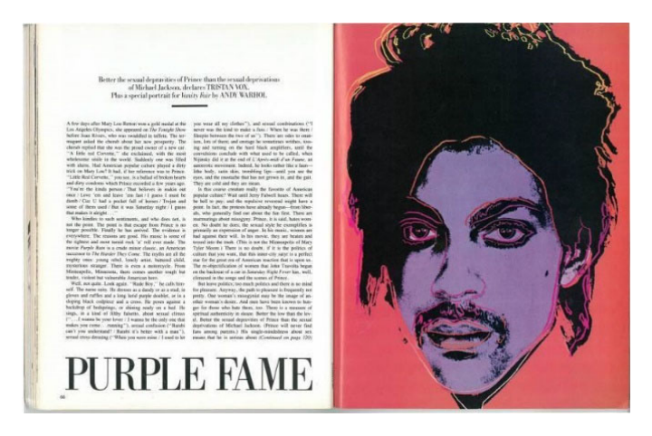
Figure 2. A purple silkscreen portrait of Prince created in 1984 by Andy Warhol to illustrate an article in Vanity Fair.

pencil drawings. The works are collectively referred to as the "Prince Series." See Appendix, infra . Goldsmith did not know about the Prince Series until 2016, when she saw the image of an orange silkscreen portrait of Prince ("Orange Prince") on the cover of a magazine published by Vanity Fair's parent company, Condé Nast. See fig. 3, infra .