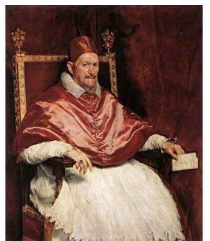
Velázquez, Pope Innocent X, c. 1650, oil on canvas