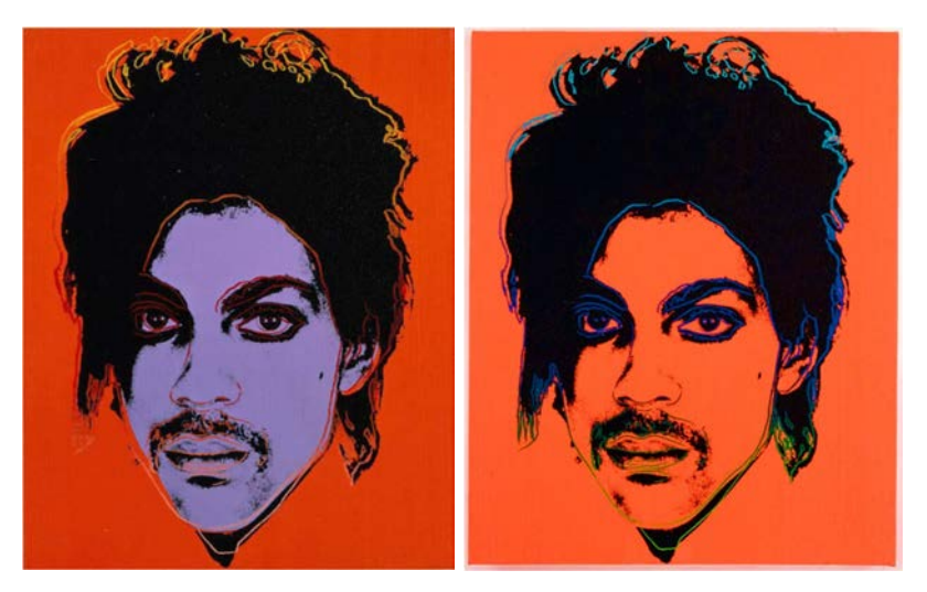
Andy Warhol, Prince, 1984, synthetic paint and silkscreen ink on canvas

174. And as before, Warhol converted the cropped photo into a higher-contrast image, incorporated into a silkscreen. That image isolated and exaggerated the darkest details of Prince's head; it also reduced his "natural, angled position," presenting him in a more face-forward way. Id., at 223. Warhol traced, painted, and inked, as earlier described. See supra , at 5–6. He also made a second silkscreen, based on his tracings; the ink he passed through that screen left differently colored, out-of-kilter lines around Prince's face and hair (a bit hard to see in the reproduction below-more pronounced in the original). Altogether, Warhol made 14 prints and two drawings-the Prince series-in a range of unnatural, lurid hues. See Appendix, ante, at 39. Vanity Fair chose the Purple Prince to accompany an article on the musician. Thirty-two years later, just after Prince died, Condé Nast paid Warhol (now actually his foundation, see supra, at 1, n. 1) to use the Orange Prince on the cover of a special commemorative magazine. A picture (or two), as the saying goes, is worth a thousand words, so here is what those magazines published: