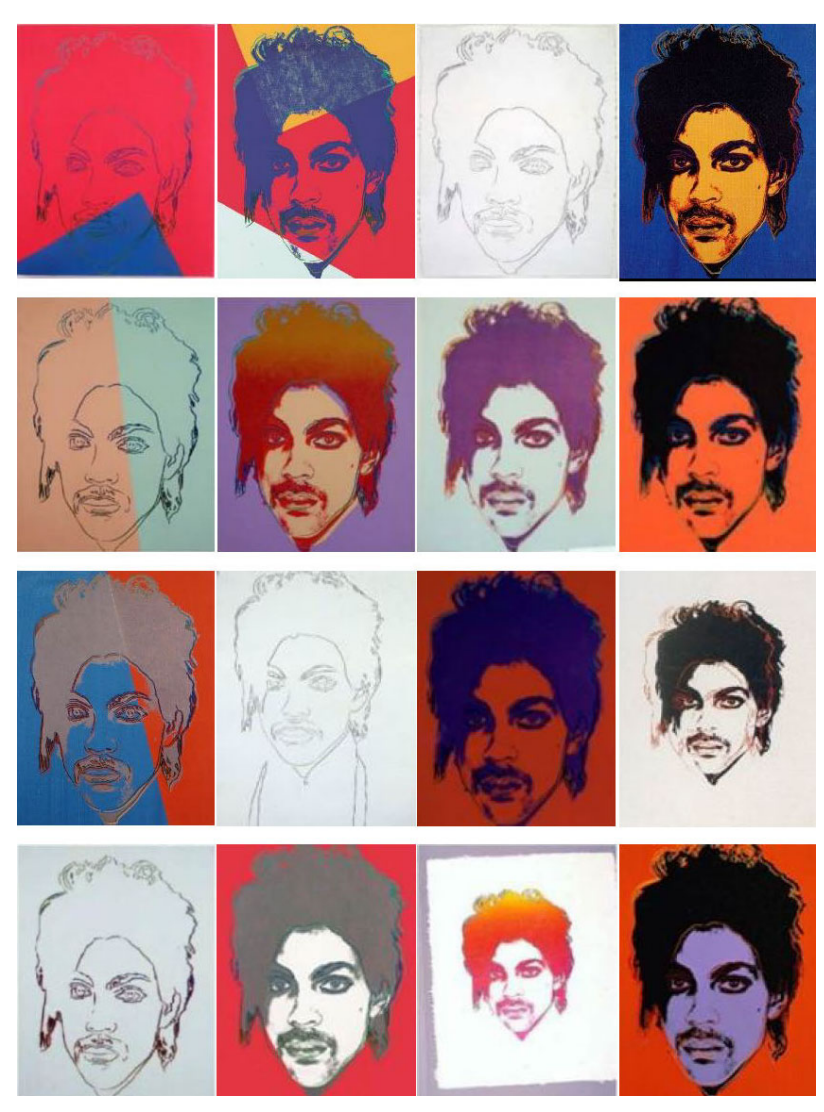
Andy Warhol created 16 works based on Lynn Goldsmith's photograph: 14 silkscreen prints and two pencil drawings. The works are collectively known as the Prince Series.