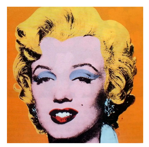
Andy Warhol, Marilyn, 1964, acrylic and silkscreen ink on linen

to function as a selectively porous mesh. Warhol would "place the screen face down on the canvas, pour ink onto the back of the mesh, and use a squeegee to pull the ink through the weave and onto the canvas." Id. , at 164. On some of his Marilyns (there are many), he reordered the process—first ink, then color, then (perhaps) ink again. See id. , at 165– 166. The result—see for yourself—is miles away from a literal copy of the publicity photo.