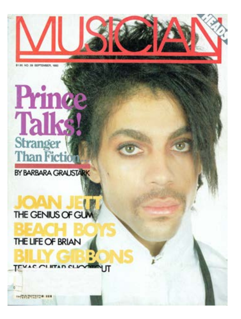
Figure 4. One of Lynn Goldsmith's photographs of Prince on the cover of Musician magazine.

People magazine, in fact, paid Goldsmith $1,000 to use one of her copyrighted photographs in a special collector's edition, "Celebrating Prince: 1958–2016," just after Prince died. People's tribute, like Condé Nast's, honors the life and music of Prince. Other magazines, including Rolling Stone and Time, also released special editions. See fig. 5, infra . All of them depicted Prince on the cover. All of them used a copyrighted photograph in service of that object. And all of them (except Condé Nast) credited the photographer.