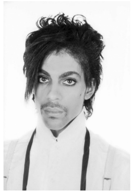
Figure 1. A black and white portrait photograph of Prince taken in 1981 by Lynn Goldsmith.

created a silkscreen portrait of Prince, which appeared alongside an article about Prince in the November 1984 issue of Vanity Fair. See fig. 2, infra . The article, titled "Purple Fame," is primarily about the "sexual style" of the new celebrity and his music. Vanity Fair, Nov. 1984, p. 66. Goldsmith received her $400 fee, and Vanity Fair credited her for the "source photograph." 2 App. 323, 325–326. Warhol received an unspecified amount.