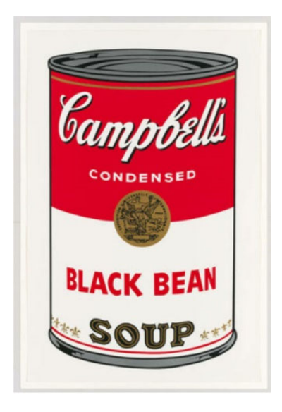
Figure 7. A print based on the Campbell's soup can, one of Warhol's works that replicates a copyrighted advertising logo.

Yet not all of Warhol's works, nor all uses of them, give rise to the same fair use analysis. In fact, Soup Cans well illustrates the distinction drawn here. The purpose of Campbell's logo is to advertise soup. Warhol's canvases do