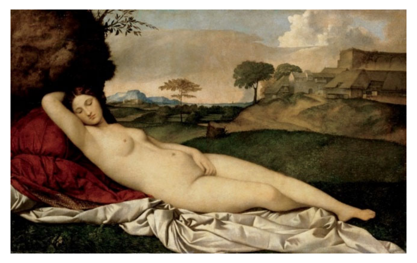
Giorgione, Sleeping Venus, c. 1510, oil on canvas

Consider as one example the reclining nude. Probably the first such figure in Renaissance art was Giorgione's Sleeping Venus. (Note, though, in keeping with the "nothing comes from nothing" theme, that Giorgione apparently modeled his canvas on a woodcut illustration by Francesco Colonna.) Here is Giorgione's painting: