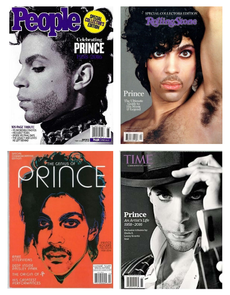
Figure 5. Four special edition magazines commemorating Prince after he died in 2016.

When Goldsmith saw Orange Prince on the cover of Condé Nast's special edition magazine, she recognized her work. "It's the photograph," she later testified. 1 App. 290. Orange Prince crops, flattens, traces, and colors the photo but otherwise does not alter it. See fig. 6, infra .