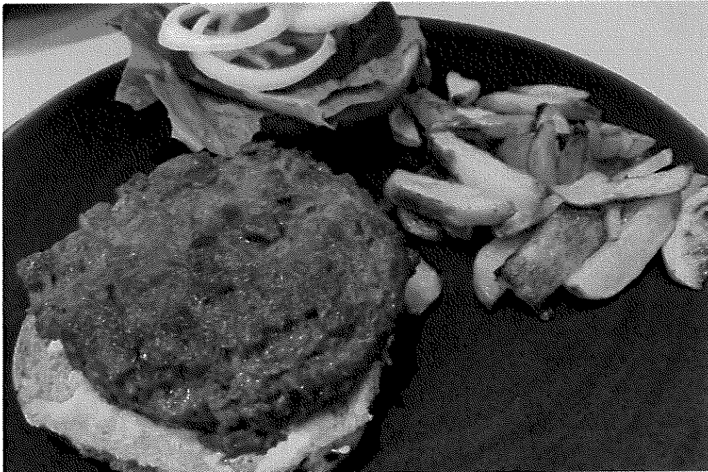
Learning to cook with plant-based 'meats'